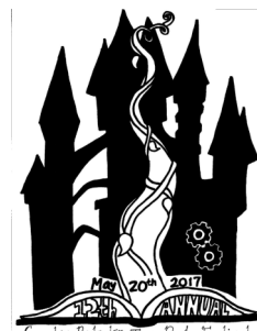
Last Year's Design

The winning design will be featured on this year's selling t-shirt!