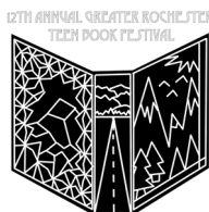
MAY 20, 2017

The winning design will be featured on this year's festival program!